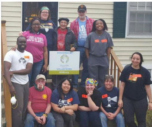
TCM 2016 Mission Trip to Nashville