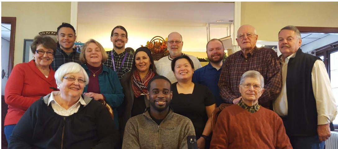
Toledo Campus Ministry 2016 Board Members

We increasingly rely on giving from local congregations and individuals, as denominational income steadily declines. We cannot do this without your faithful partnership!