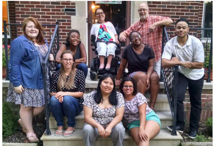
TCM 2016 Student Leadership Team

Toledo Campus Ministry is a welcoming, open and affirming ecumenical ministry on the campus of the University of Toledo seeking to provide a safe, authentic, Christian community welcoming and nurturing students in Christ's love. As such, we are mandated to: